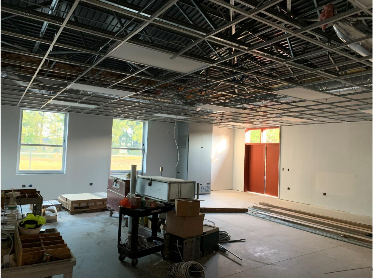
The art room has seen similar progress during the last week.